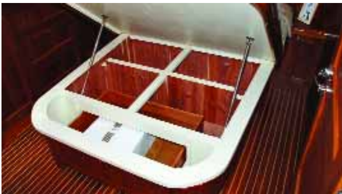
Under bed storage is cedar-lined