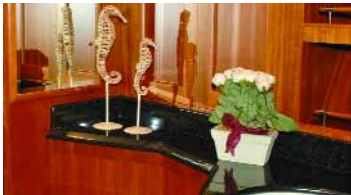
Vanity in guest stateroom head