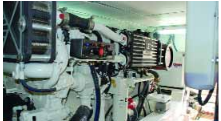
Each Caterpillar C-15 ACERT is rated at 853 HP