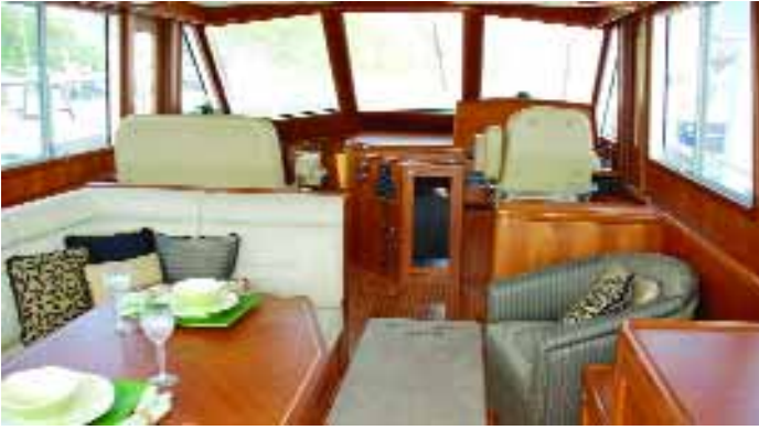
Main Salon looking forward