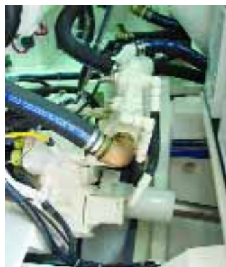
Starboard propeller shaft