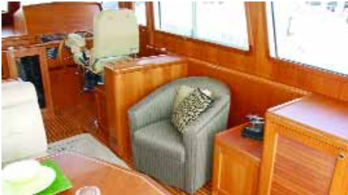
Main Salon starboard side