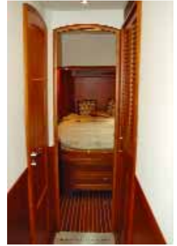
Hallway, looking forward