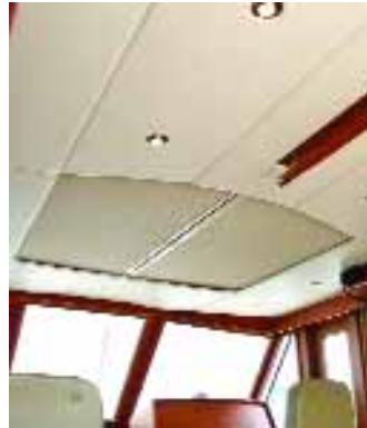
with sunshade closed