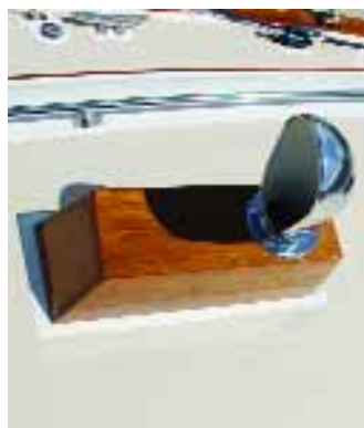
Chrome dorades on the foredeck