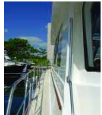
Wide side decks and high rails for line handling