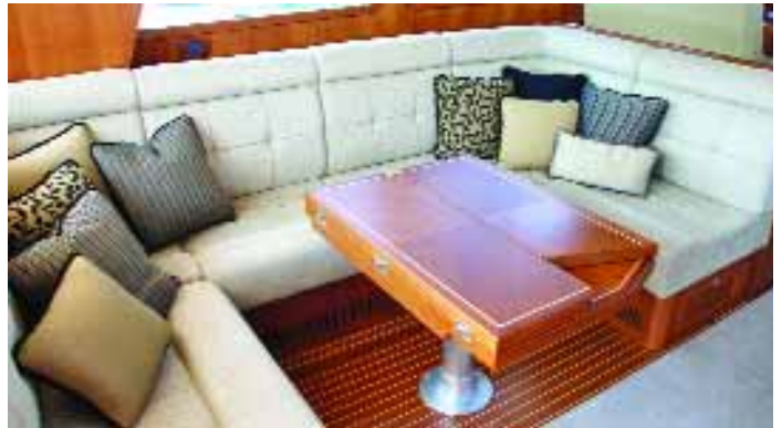
Main Salon looking forward