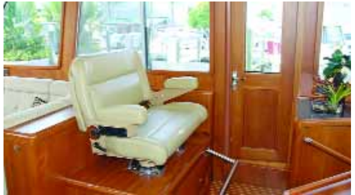
Double Stidd® seat on port side