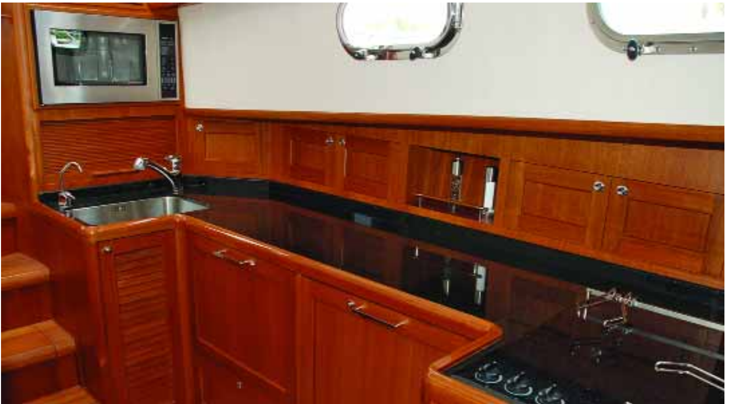
"Absolute Black" granite countertops. Water purification system is installed under sink