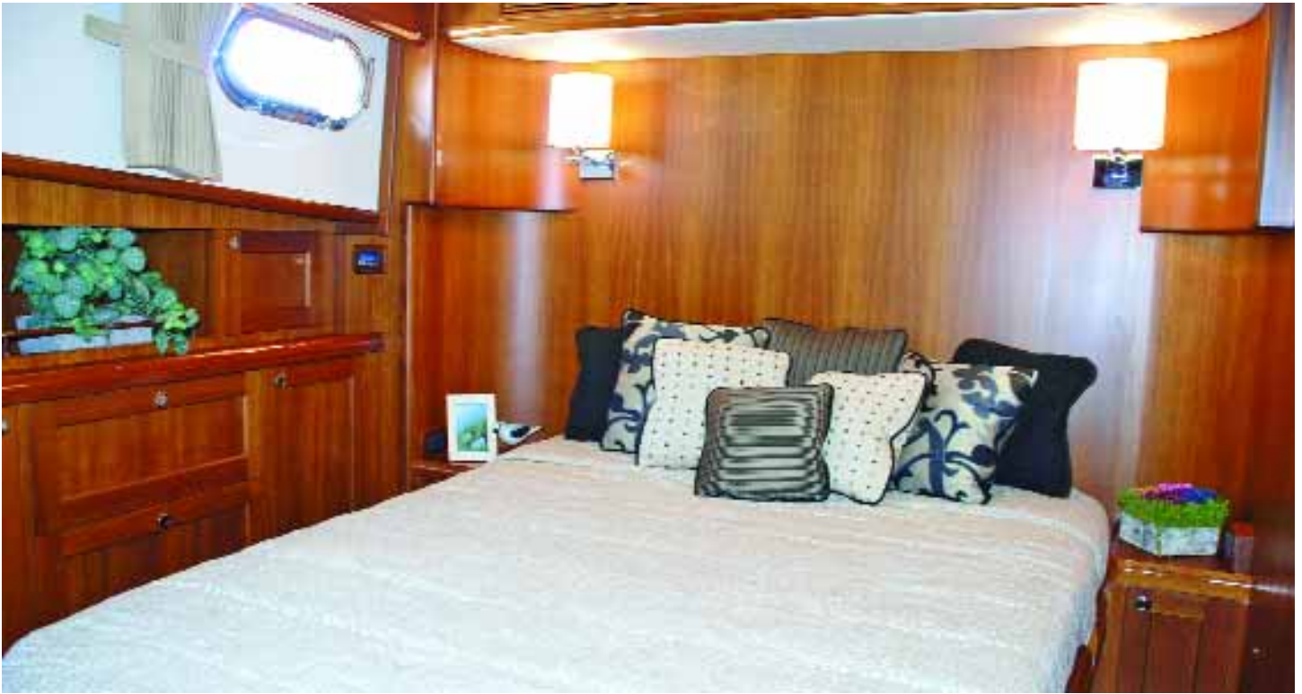
Master stateroom is midships, opposite the galley, and features a walkaround queen berth.