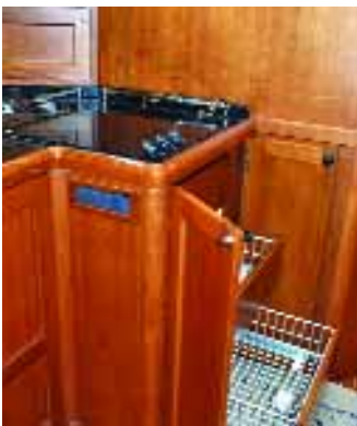
Pot holders on cooktop for cooking underway