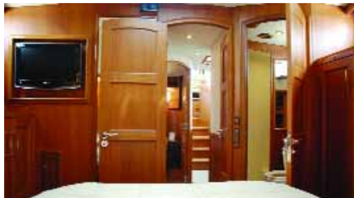
Guest stateroom looking aft