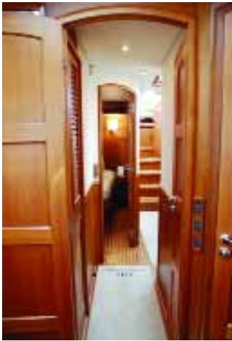
Hallway, looking aft from guest stateroom