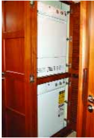
Washer and dryer are in the hallway