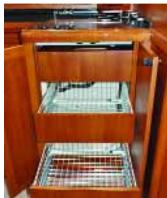
Rack bin storage below cooktop