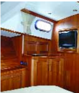
Starboard side of guest stateroom