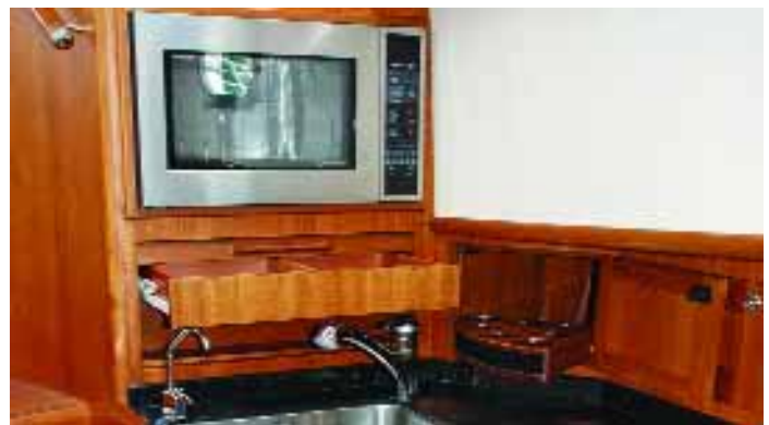
Tambour door hides cutlery drawer under microwave. Note swing-out cup holder in corner.