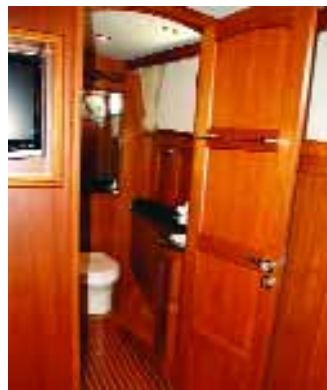
Master stateroom has ensuite head and shower