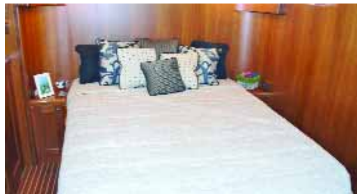
An overhead hatch provides plenty of natural light