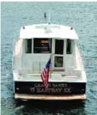
View from Aft