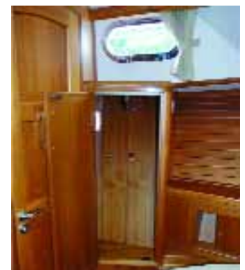
Hanging locker on port side