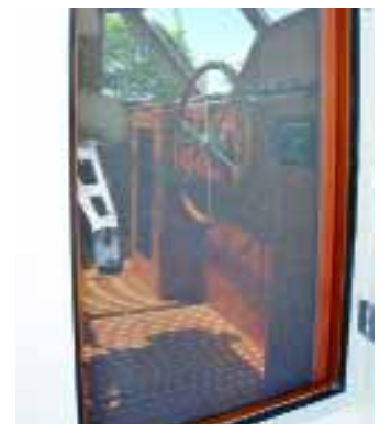
Screen doors on both sides of salon & aft door