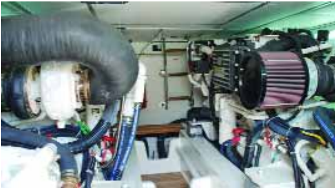
Engine room looking forward