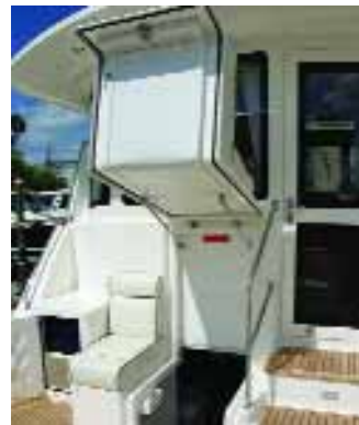
Staircase to engine room