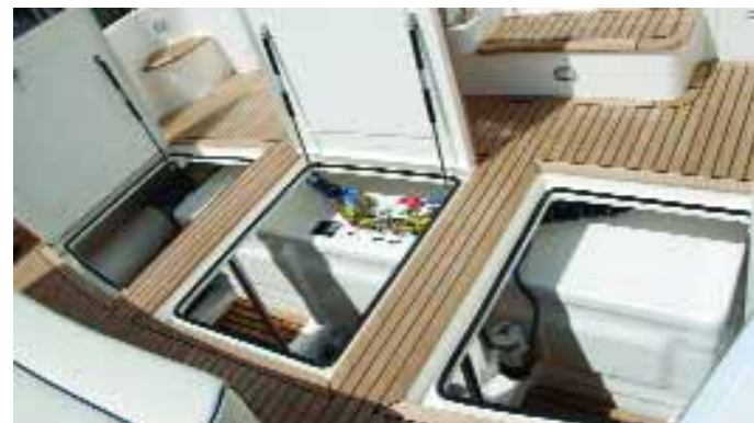
Three cockpit lazarettes can store a lot of gear