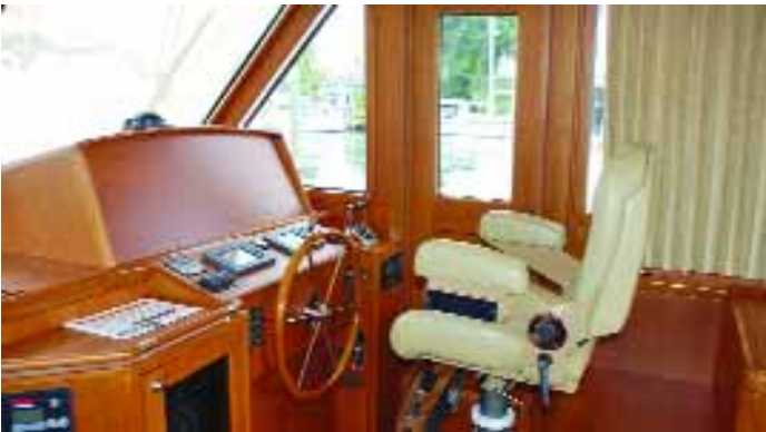
Helm station is redesigned with a larger electronics console, full-size steering and pedestal seat.