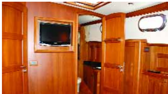
Built-in flat screen TV on the forward bulkhead