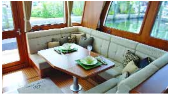
Main Salon port side