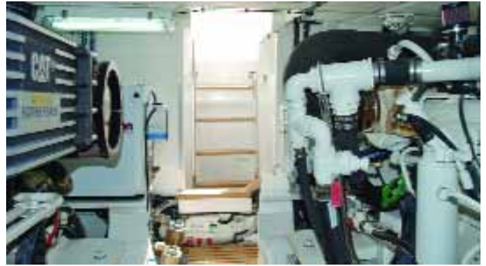
Ladderway exit at the aft of engine room