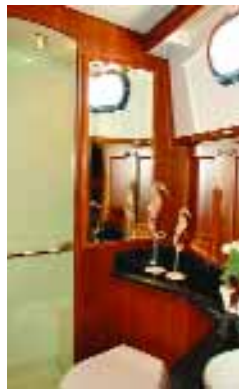
Guest stateroom head and shower